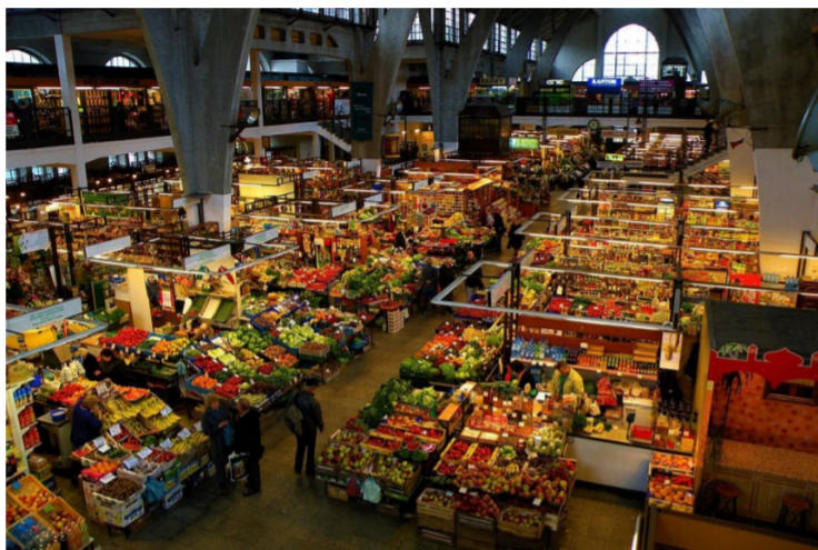
A local energy market buys & sells electricity instead of fruit and veg, but everyone still has to be able to get access to the market to get a 'good deal'.

The Smart and Fair Neighbourhoods programme will help us understand how to do this in an equitable and fair way for everyone in Oxfordshire so that we can all enjoy the opportunities and benefits it will bring.