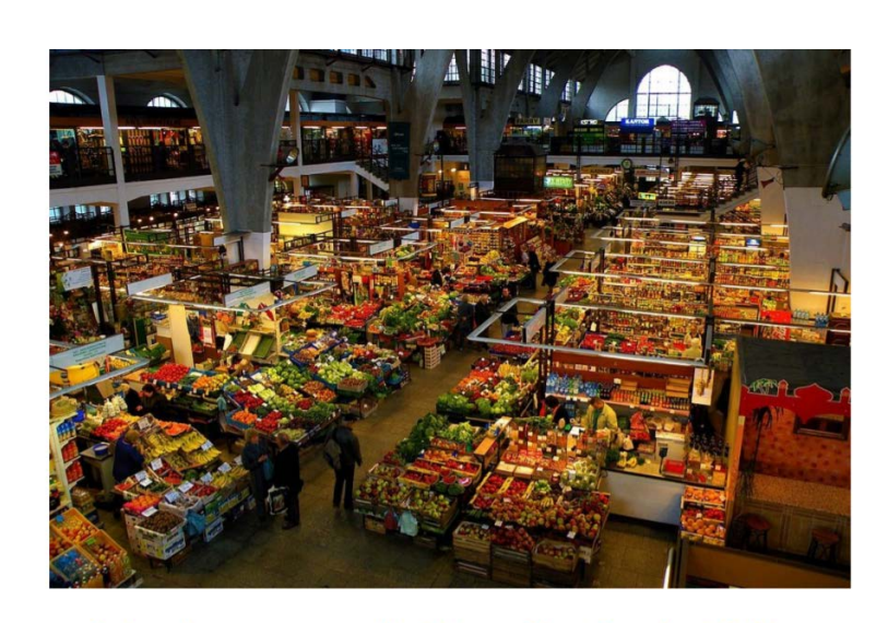
A local energy market buys & sells electricity instead of fruit and veg, but everyone still has to be able to get access to the market to get a 'good deal'.

The Smart and Fair Neighbourhoods programme will help us understand how to do this in an equitable and fair way for everyone in Oxfordshire so that we can all enjoy the opportunities and benefits it will bring.