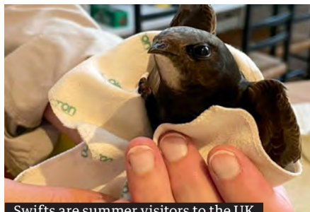
Swifts are summer visitors to the UK

We also had a successful swift rescue. If you see a swift on the ground, it is in trouble. So, when Sally saw a stunned and stranded swift on Acre End Street, she scooped it up, looked after it and delivered it to Tiggywinkles Wildlife Hospital. We heard that the swift survived to fly another day.