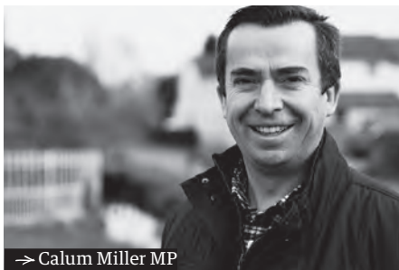
→ Calum Miller MP

We expect the new arrangements to be in place by 2027, but we will still be having County Council elections in May 2025.