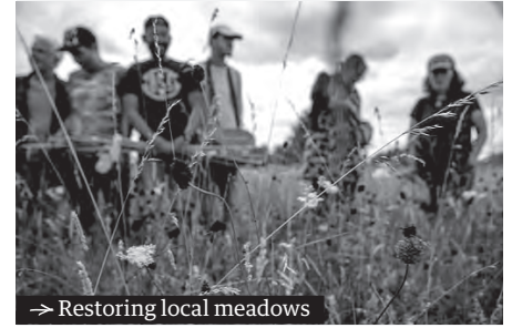
→ Restoring local meadows

What do you think? We'd love to cover it in Eynsham News!