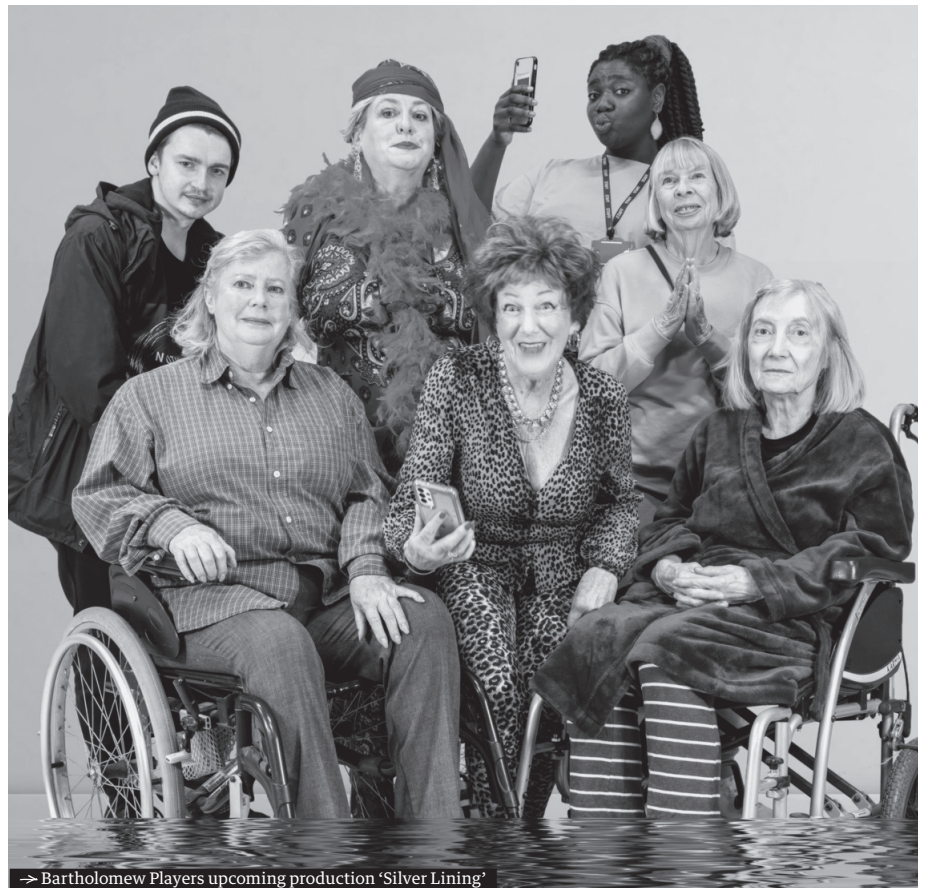
→ Bartholomew Players upcoming production 'Silver Lining'

To book or to register to get invites to all meetings please email FreelandWineClub@gmail.com