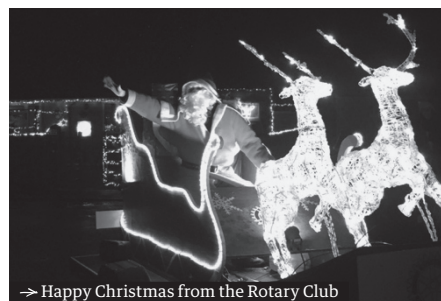
→ Happy Christmas from the Rotary Club

We are hoping to set up our permanent exhibition, telling the story of Eynsham's long and distinguished history, next year and if you have any items or information which you think could contribute to that story then please contact us as above.