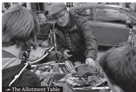
→ The Allotment Table

True to the harvest season, there have been an abundance of fabulous events in Eynsham, organised by local residents, for local people of all ages. Thank you to all who took the time to host these brilliant events and bring our community together!