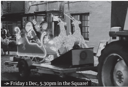
→ Friday 1 Dec, 5.30pm in the Square!