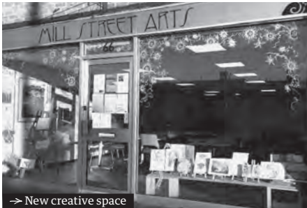
→ New creative space

Eynsham News needs some new editing and writing help. If you'd like to put some of your time and skills into this local magazine, please email: editor@eynshamnews.org.uk