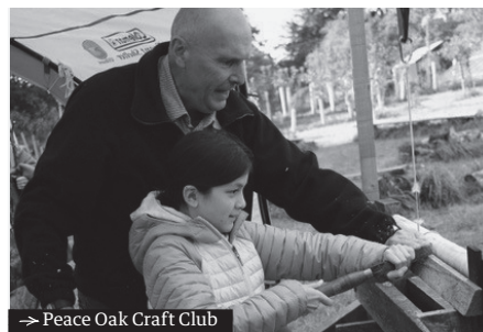
→ Peace Oak Craft Club

Shortly after this event, we closed Dovehouse Close play area for a week of critical safety repairs. This is all complete and the play area is now open again. We greatly appreciate the patience of our community during these periods of closure as we work to keep our play areas in good shape for the many who enjoy using them.