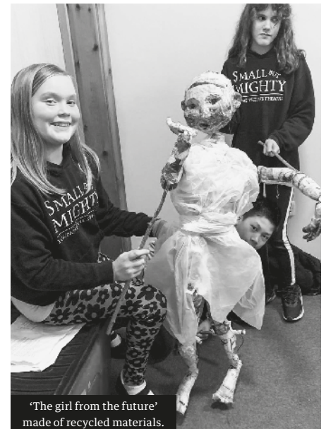
'The girl from the future' made of recycled materials.

To find out more and get involved visit: nature-recovery-network.org