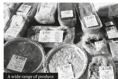
A wide range of produce

The Country Market is held on Thursday mornings in the market Square selling homemade cakes, savouries, cookies, preserves, honey and pickles, vegetables and garden plants in season, and eggs. You can order in advance for collection by 09:45 and we are happy to make up gift boxes too. There are also crafts, cards, woodwork, stitched and knitted goods, with tea and coffee available from the Bartholomew Room too.