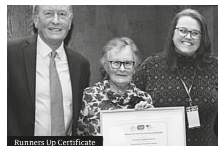
Runners Up Certificate

We have lots planned for 2023 and we hope to provide special produce to celebrate Valentine's Day, Easter and Mother's Day. Our special Saturday markets will return including a Coronation Themed Market on 29th April, Plant Sale on 27th May and 'Baking Around Britain' in September. For the latest news please see our page on Eynsham Online, follow us on Facebook, Instagram or Twitter or email eynshamcountrymarket76@gmail.com . We are always looking for new producers so if you can bake, make preserves, grow your own veg, or make hand-made crafts, please get in touch. If you do not do any of these things but would still like to join our friendly team as a volunteer, you would be very welcome.