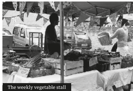
The weekly vegetable stall

"Every Saturday we would arrive bright and early after a late night picking our produce and preparing the salad mix for sale the next morning. We were both still working full time alongside growing the veg on what had become our smallholding. After our marriage in September 2009, we both decided to leave the safety of our jobs and concentrate on the growing and markets full time. It was tiring work but very fulfilling. We were out there come rain, come shine, and on one memorable market day, come snow!